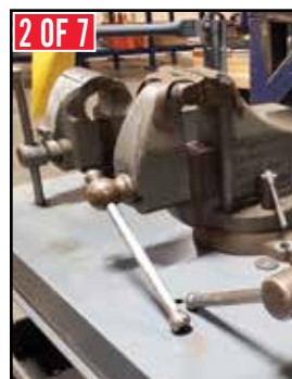
(7) Assorted Bench Vises