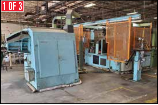
(3) BIHLER BZ2 & GRM50 Forming Machines