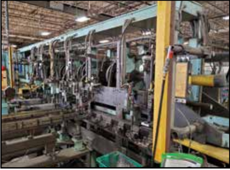
BODINE 64 Assembly Machine