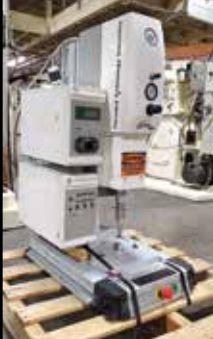
FTI Ultra Sonic Welder