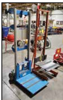
(2) GENIE & WESCO 500-lb. Lifts