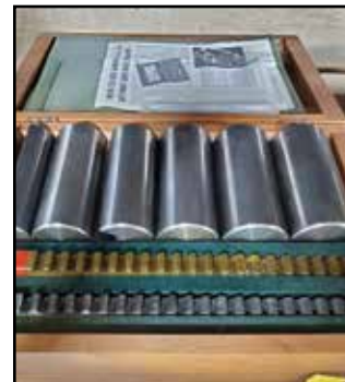
(3) Keyway & Hole Broach Sets