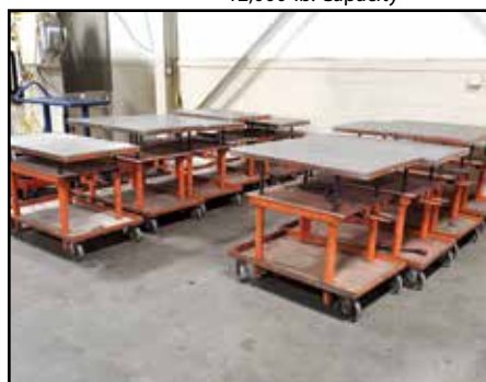
(9) ECONOMY 2,000-lb. Mechanical Die Lift Tables