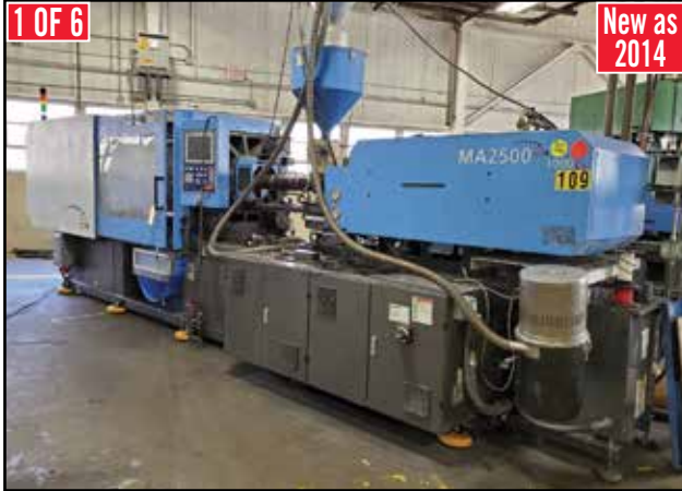
(6) HAITIAN & CINCINNATI Plastic Injection Molders