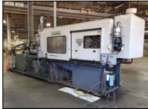
CINCINNATI MILACRON VH-250-13 250-Ton Plastic Injection Molder