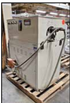
ARMATURE 3-VAS Coil Equipment Twister