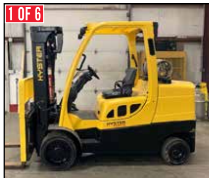
(6) HYSTER, YALE & TOYOTA Forklifts to 12,000-lb. Capacity