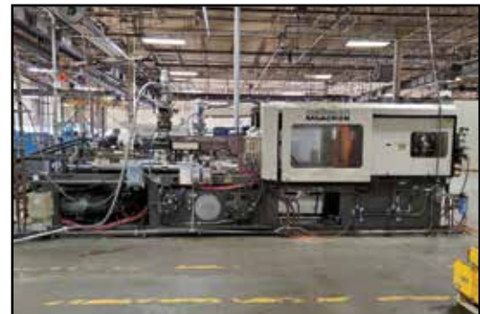
CINCINNATI MILACRON VH-400-29 400-Ton Plastic Injection Molder