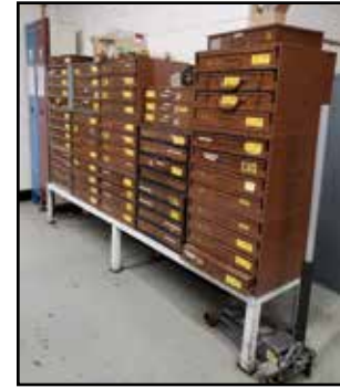
LAWSON Sliding Drawer Cabinets w/Assorted Hardware