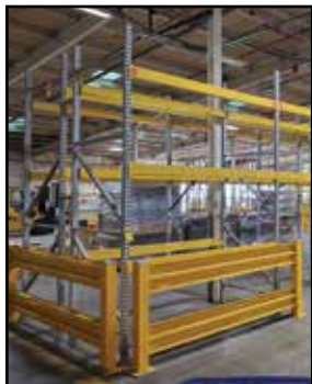
(50) Sections Pallet Racking