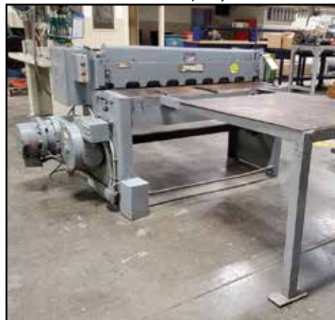
ONE SERIES 4' x 14-Ga. Power Shear