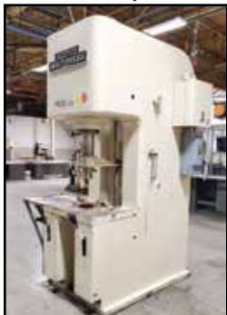
DENISON 50-Ton Hyd. Multipress