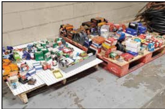
Assorted Bearings & Bearing Pullers