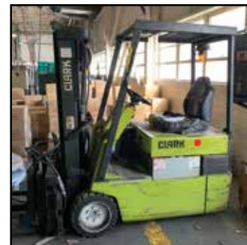
CLARK 3,500-lb. 3-Wheel Forklift