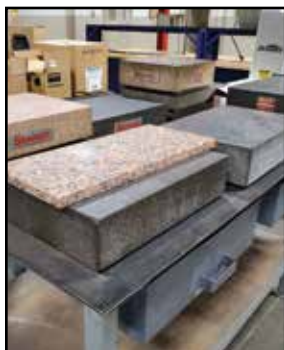
Assorted Granite Surface Plates