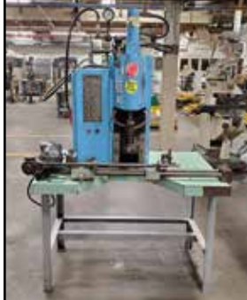
HANSON AB-6 Spot Welder