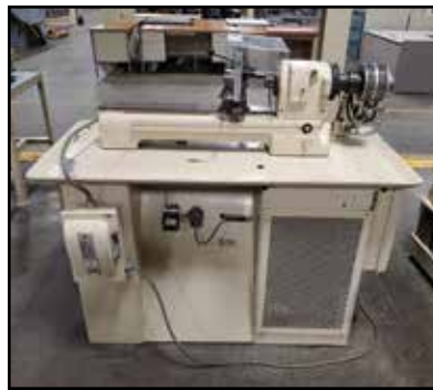
HARDINGE DV59 Super Precision Lathe