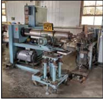
REIFENHAUSER Plastic Extruder System