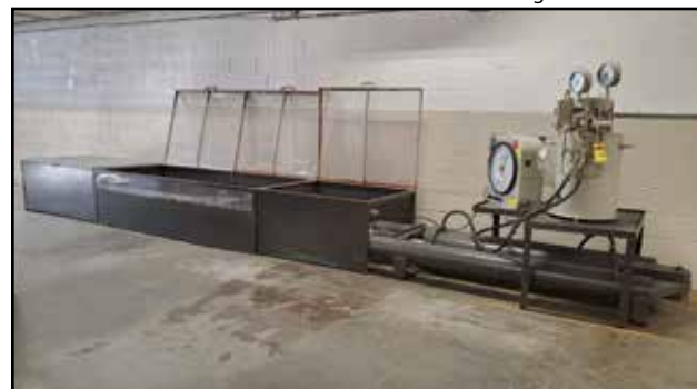
TINIUS OLSEN Horizontal Pulling Tensile Tester