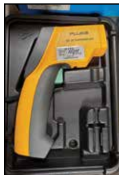
FLUKE 63 IR Thermometer