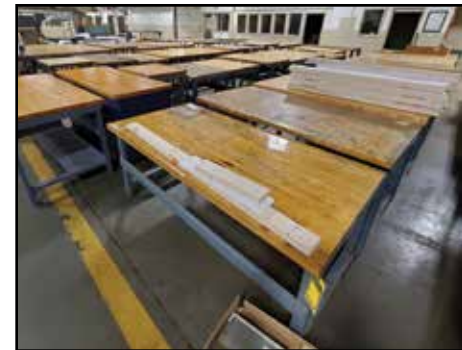
(40+) Butcher Block Work Tables