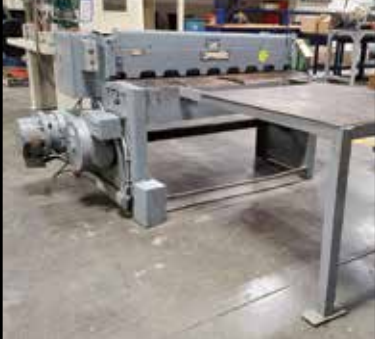
ONE SERIES 4' x 14-Ga. Power Shear