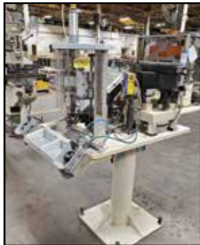
Drilling & Tapping Machine