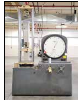
TINIUS OLSEN Vertical Tensile Testing Press