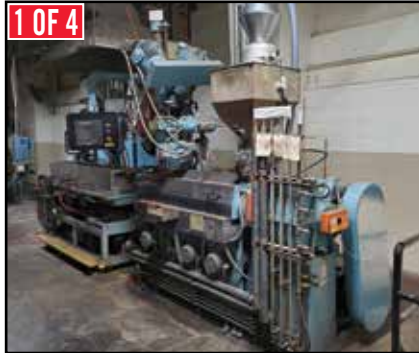
(4) DAVIS STANDARD Thematic Plastic Extruders

Myron Bowling Auctioneers Inc. P.O. Box 369 ROSS, OHIO 45061