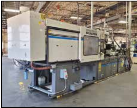
CINCINNATI MILACRON VH-300-21 300-Ton Plastic Injection Molder