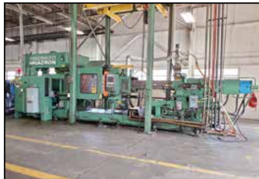
CINCINNATI MILACRON 500-70 500-Ton Plastic Injection Molder