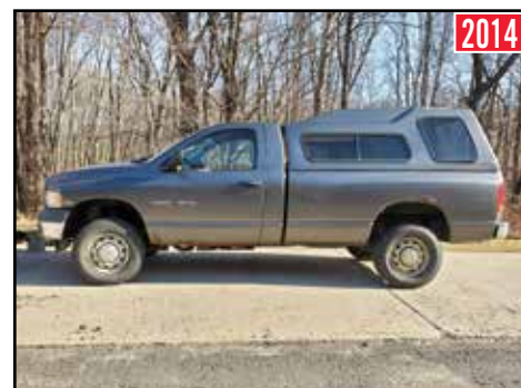
DODGE 2500 4X4 Pickup Truck