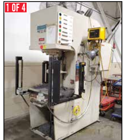
(4) DENISON Multipresses to 50-Ton Capacity