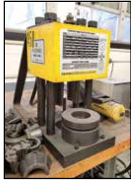
COLLOCRIPT T-100 Hydraulic Hose Crimper