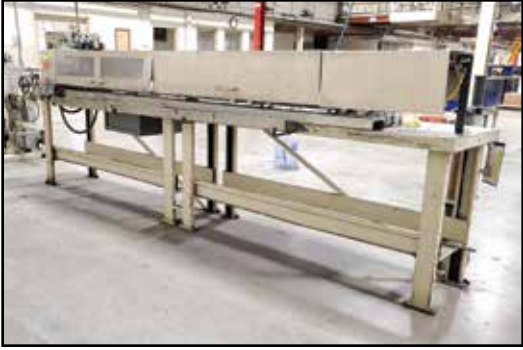
EWALD Flash Cutter