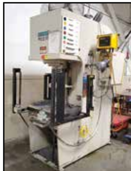
DENISON ABEX 35-Ton Multipress