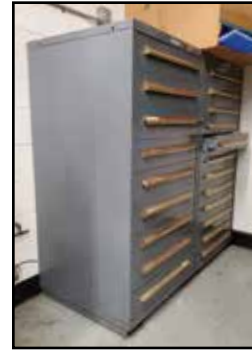
(2) EQUIPTO Cabinets w/Assorted Hardware