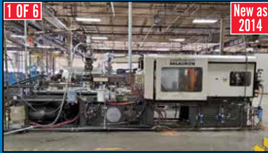
(6) HAITIAN & CINCINNATI Plastic Injection Molders