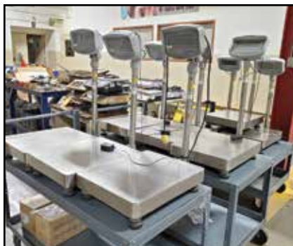
(9) AE ADAM Digital Scales