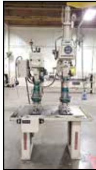
(2) RMT & CLAUSING Drill Presses

tors & More DETRONIC Calibrated Thread Measuring Wires Mandrel Sleeve Press Key Switch Tester Granite Surface Plates (15+) Platform & Digital Scales