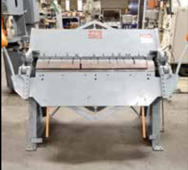
CHICAGO DREIS & KRUMP 4' Bending Brake