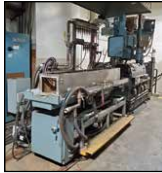
(2) METAPLAST Stainless Steel Bath Tanks