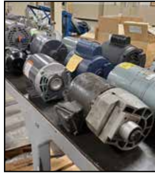
Miscellaneous 5-HP to 20-HP Motors, Gear Drives & Reducers