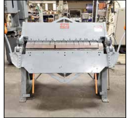
CHICAGO DREIS & KRUMP 4' Bending Brake