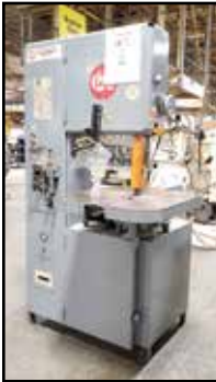
ROB RW-B Vertical Band Saw