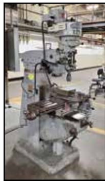
BRIDGEPORT Vertical Mill