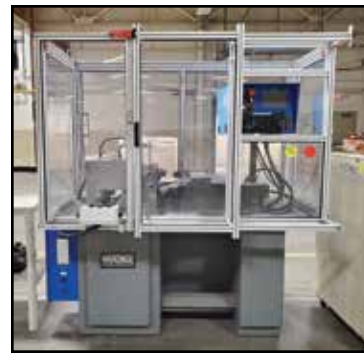
HARDINGE Super Precision CNC Lathe