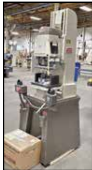
JARVIS 27-H Drilling & Tapping Machine