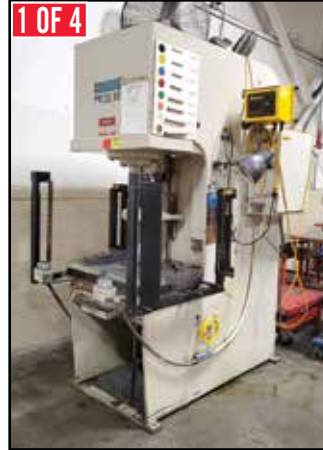
(4) DENISON Multipresses to 50-Ton Capacity