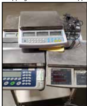
(5) METTLER TOLEDO & AE ADAM Digital Scales