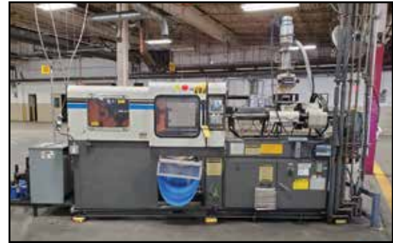
CINCINNATI MILACRON VSX-55-2-97 55-Ton Plastic Injection Molder