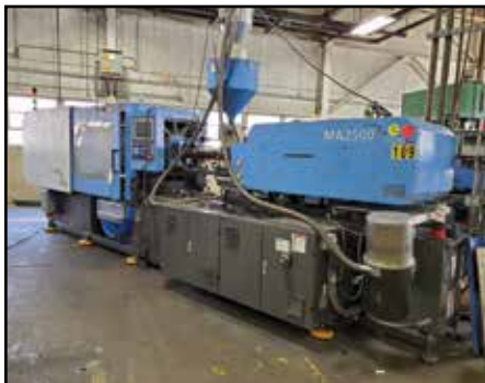
HAITIAN MA2500II 250-Ton Plastic Injection Molder