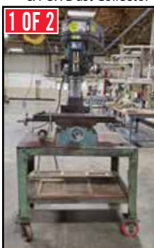
(2) MSC Milling & Drilling Machines