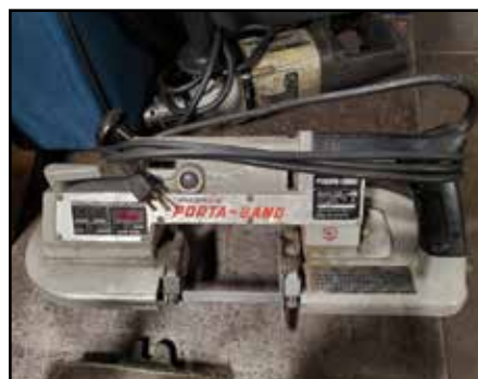
PORTA CABLE 736 Band Saw