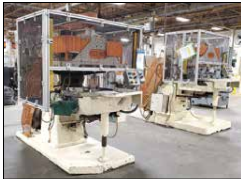
(2) BODINE 42-30 Drilling & Tapping Machines