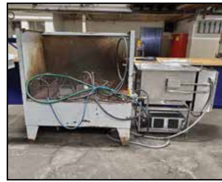
RAMCO Equipment Ultra Sonic Cleaner