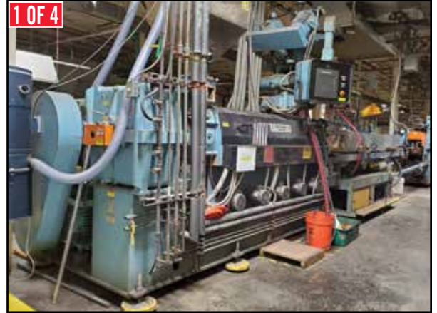
(4) DAVIS STANDARD Thematic Plastic Extruders

INSPECTION: DAY PRIOR TO AUCTION FROM 9AM - 4PM