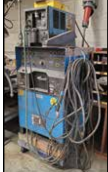
MILLER Syncrowave 350LX TIG Welder