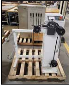
SCHLEUNIGER 2200 Pre-Feeder