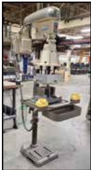
ETTCO 2106 Drilling & Tapping Machine