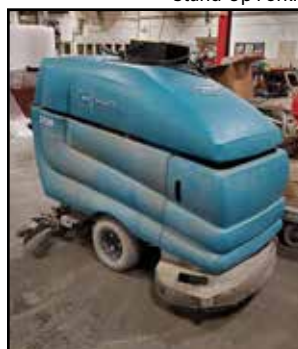
TENNANT ECH20 5700 Powered Floor Scrubber