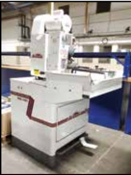
SUNNEN MBB-1660-K Precision Hone