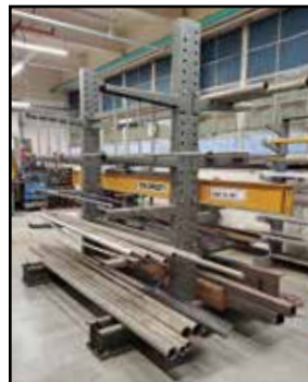
Cantilever Racks w/ I-Beams, Round & Assorted Stock