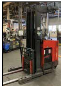
RAYMOND R30TT 3,000-lb. Stand-Up Forklift