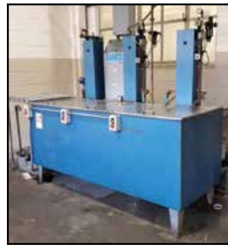
RAMCO Parts Washer