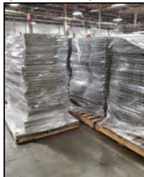
Large Quantity of Wire Mesh Decking