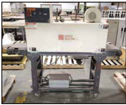
UNITED SILICONE Drying Pass-Through Conveyor Oven & Kiln Oven