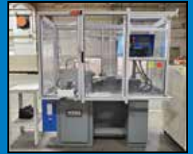
HARDINGE Super Precision CNC Lathe