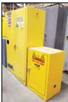
Assorted Flammable Cabinets