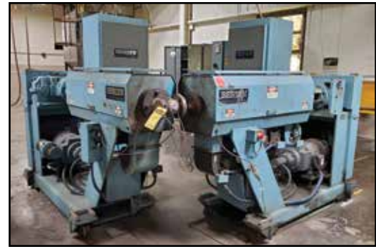
BERLYN Plastic Extruder