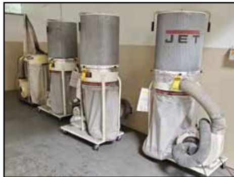
(4) JET VORTEX Cone Particle Separation Systems & FOX Dust Collector