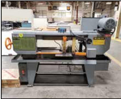
DO-ALL C-916 Horizontal Band Saw