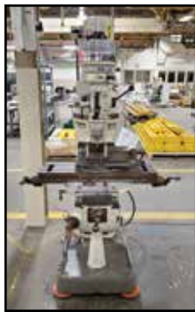
BRIDGEPORT Textron Vertical Mill