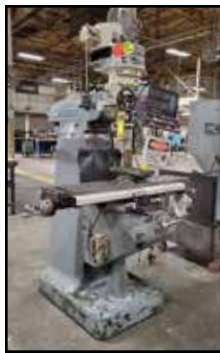
BRIDGEPORT ALLIANT Vertical Mill