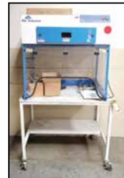
AIR SCIENCE Pur-Air Ductless Fume Hood